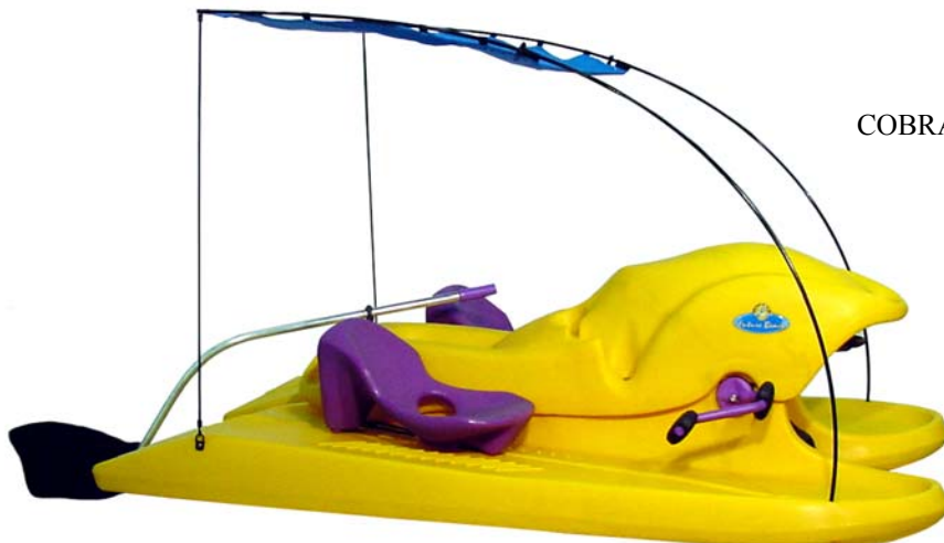
COBRA SPORT WITH LONG TILLER