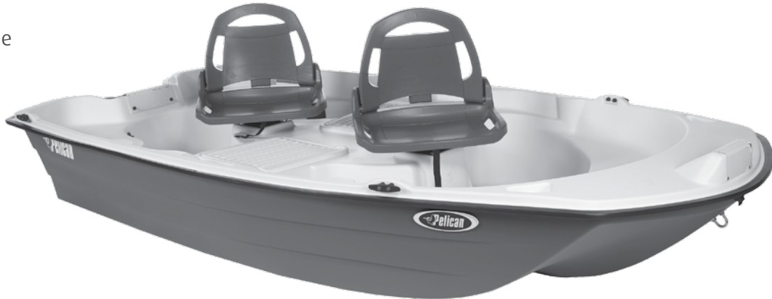
MODEL SHOWN: PREDATOR 103